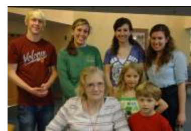
On Monday, November 14, College Ministries visited residents at Azalea Gardens.