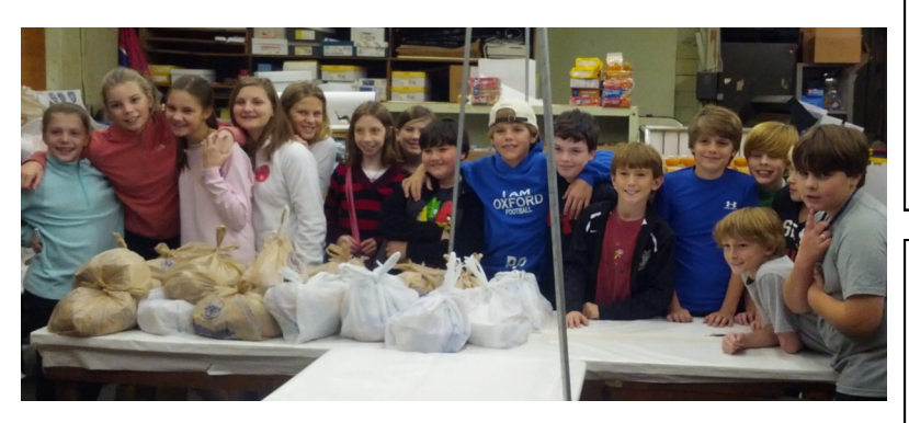
F.I.S.H. kids packed Love Packs and baked cookies for the Hispanic Ministry at St. Peter's Episcopal Church on Sunday, November 25.

Bring a small gift and join us for the festivities! This will be our last F.I.S.H. meeting for 2012. F.I.S.H. begins again Sunday, January 13.