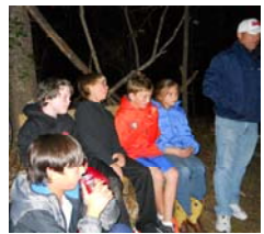
Chuck Wagon Bonfire