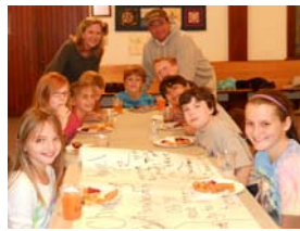
Operation Christmas Child

Our group will then turn their attention to the Christmas season by helping to make angels for our Angel Tree and ornaments to be packed in Christmas boxes given out by the church office.