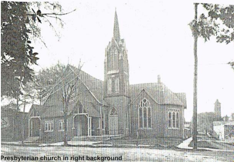
Presbyterian church in right background

As one church historian notes, "It would be hard to think of a more disastrous ending for the congregation, having suffered two losses by fire within a few months, both the parsonage and the sanctuary." But the city was generous and allowed the church to meet in different places throughout Oxford. Word of the loss spread widely, and support came from all over the state. Members of the church began making contributions, and careful records were kept. Likewise, careful records were kept of the expenses involved in building a new building. The minister was reassigned, but he made sure that Methodists throughout the state were kept informed of the continuing needs.